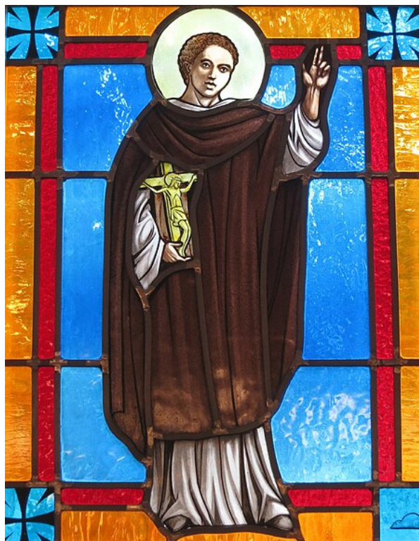
St. Peter Claver (stained glass) Saint Stephen Catholic Church (Chesapeake, Virginia)

In every age, O Lord, you have been our refuge. Psalm 90:1