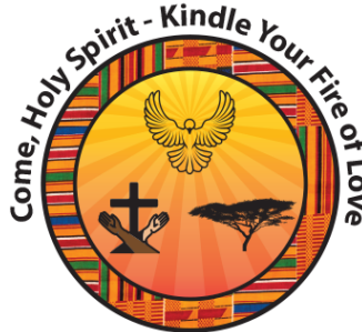
Holy Spirit Church

The greatest among you must be your servant.