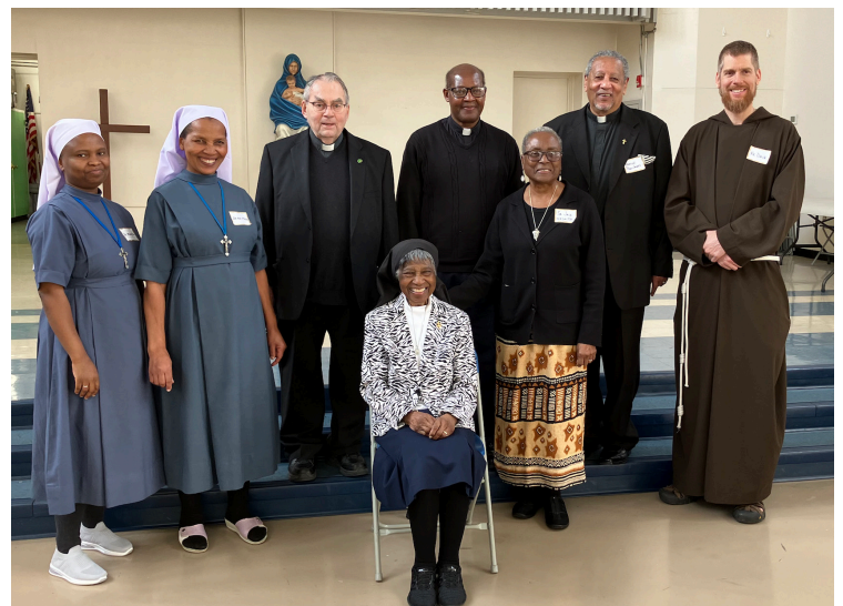
Clergy and religious men and women attending OGN's Anniversary Celebration last Saturday!