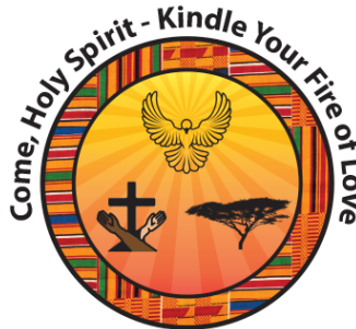
Holy Spirit Church

Your ways, O LORD, make known to me; teach me your paths, guide me in your truth and teach me, for you are God my savior.