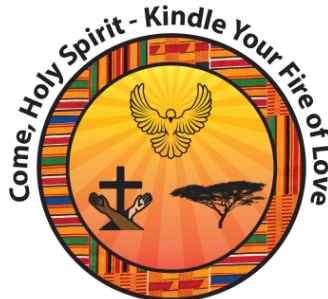
Holy Spirit Church

Seek the LORD while he may be found, call him while he is near... For my thoughts are not your thoughts, nor are your ways my ways, says the LORD.