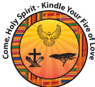
Holy Spirit Church

"Lord, if my brother sins against me, how often must I forgive? As many as seven times?"