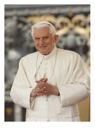
"Each of us is the result of a thought of God. Each of us is willed. Each of us is loved. Each of us is necessary."

10:30 am The People of Holy Spirit Parish