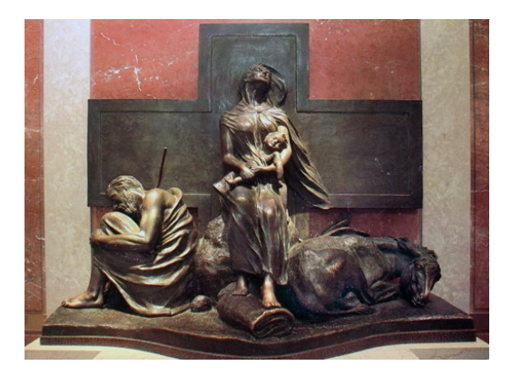
ON HELPING A REFUGEE FAMILY

Shortly after the Thanksgiving holiday, a small group of us met with representatives of Catholic Charities to finally move this initiative forward. After considering several ways our parish might respond to a growing refugee crisis, we believe that the best option for us is to sponsor a family that has resettled in Cleveland.