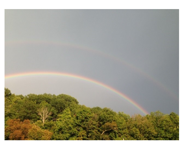
PARISH PICNIC SUNDAY, AUGUST 14<sup>TH</sup>

Please hold them in your prayers during these last couple of weeks of preparation for the sacrament.