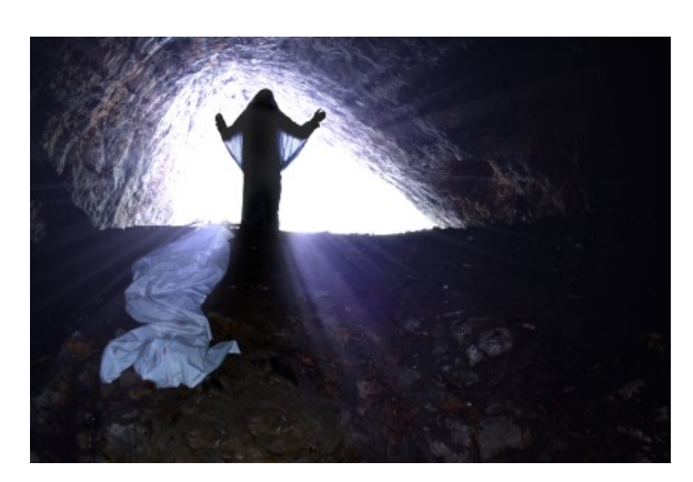
FOR A SYNODAL CHURCH COMMUNION PARTICIPATION MISSION

... and we offer their families every support as they strive to fulfill their duty as Christian families.