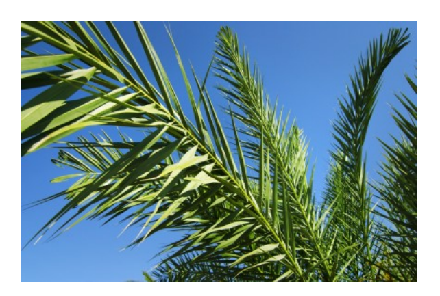
THE SACRED PASCHAL TRIDUUM

The holiest and most solemn of all church celebrations are this week, as we celebrate Holy Thursday, Good Friday, and Easter – the Paschal Triduum. The church's celebration of Easter begins with the long vigil that begins after sunset on Saturday night – as we keep watch for the signs that our loving Lord is alive and his tomb is empty.