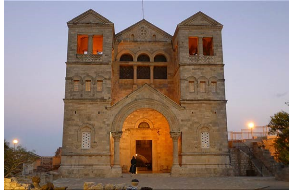
Church of the Transfiguration, Mount Tabor