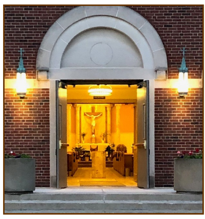
But now we are open