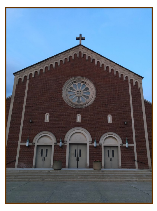
Once we were closed