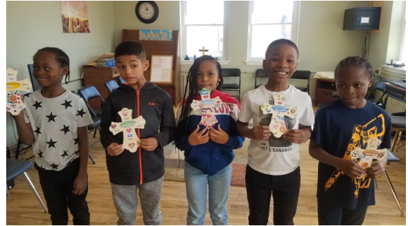
"Let the children come to me." – Matthew 19: 14

The last part of the survey also serves as a registration form for our fall sessions. Together we can create a quality experience for our youngsters and do our part to lead them to an authentic love for our good God. Please lend us your support and cooperative efforts.