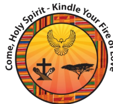
Holy Spirit Church

On our parish feast day, it seems appropriate to remind ourselves of the meaning behind our parish logo.